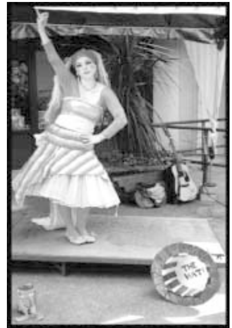
Below: An Unknown Busker