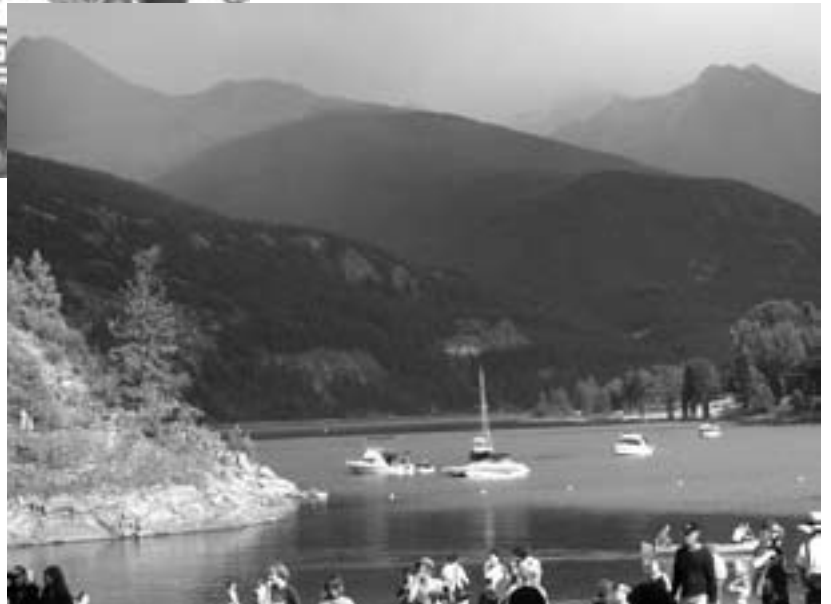
Backdrop for the Jazz Etc. Festival in Kaslo B.C. The stage is to the right!