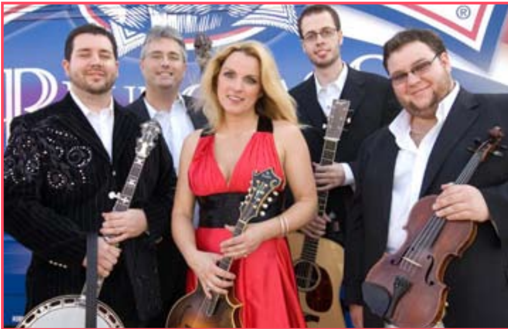
Above: Rhonda Vincent and the Rage